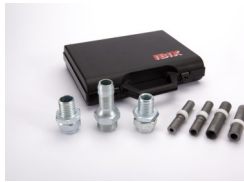
IBIX 40 Nozzle Kit